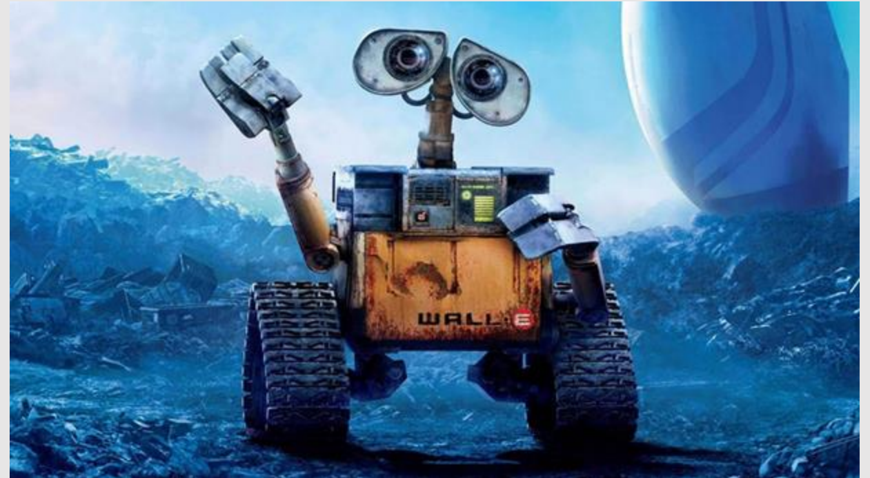
WALL-E (2008) Pixar